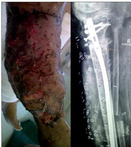
Figure 3: Latissimus dorsi pedicle flap was done to cover the wound and implant removal and intramedullary nailing was performed in a single stage