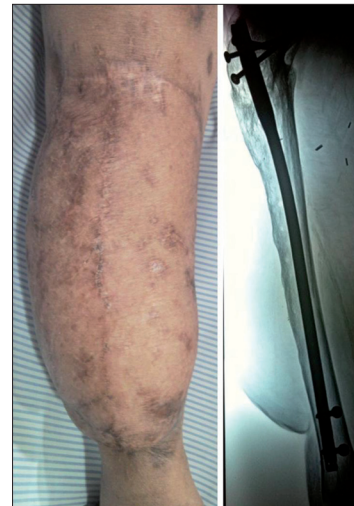
Figure 4: Clinical and radiographic appearance at 20 months postsurgery showing healing of both soft tissue and the bone